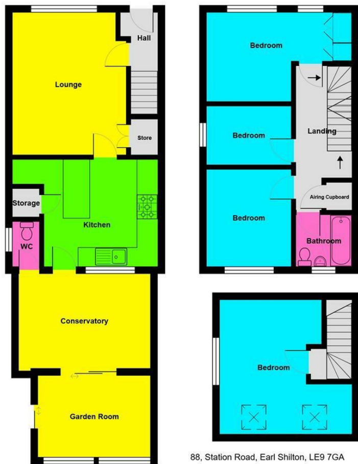
88, Station Road, Earl Shilton, LE9 7GA Total Area: 119.3 m 2 ... 1284 ft 2

All measurements are approximate and for display purposes only